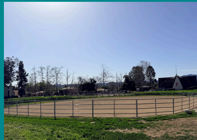
Janss Arena: 120' × 120'