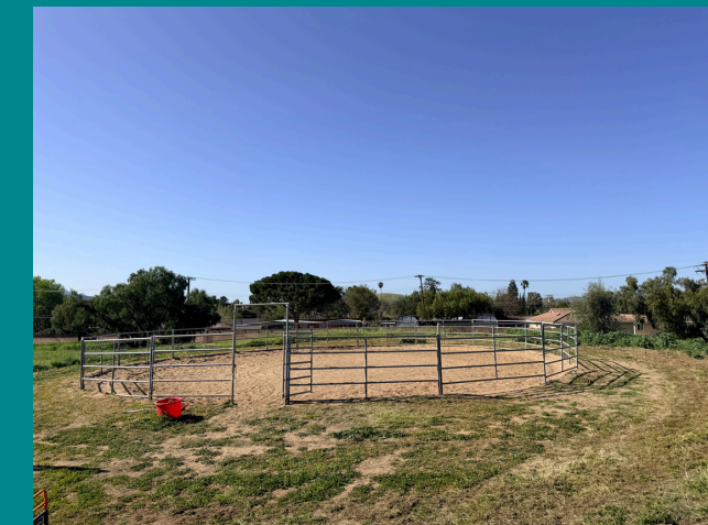
Three 60' Round Pens