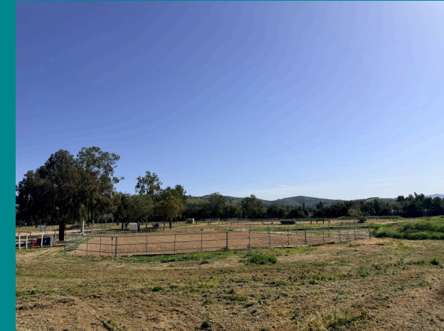
Obstacle Arena: 80' × 145'