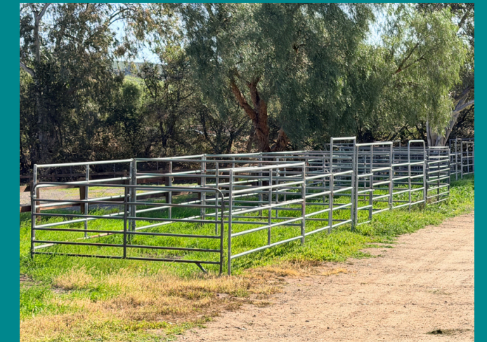
Temporary Stalls Ten 12x12 corrals One 10x12 corral One 12x18 corral

Temporary evacuation corrals that allow Conejo Creek Equestrian Park to serve as a safe staging and shelter location for horses and livestock during wildfires and other community emergencies.