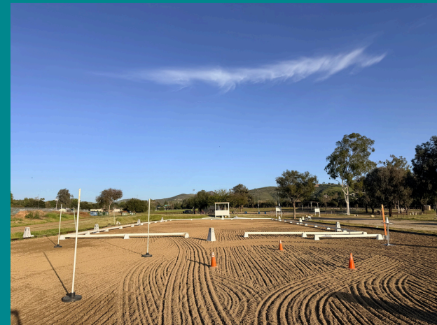
Dressage Arena: 200' × 80'