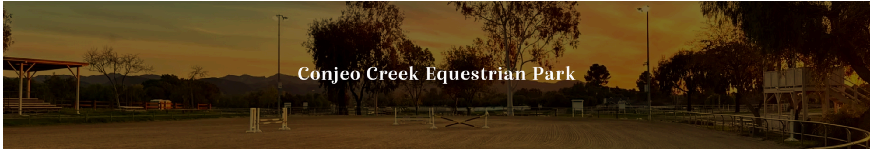
Conjeo Creek Equestrian Park