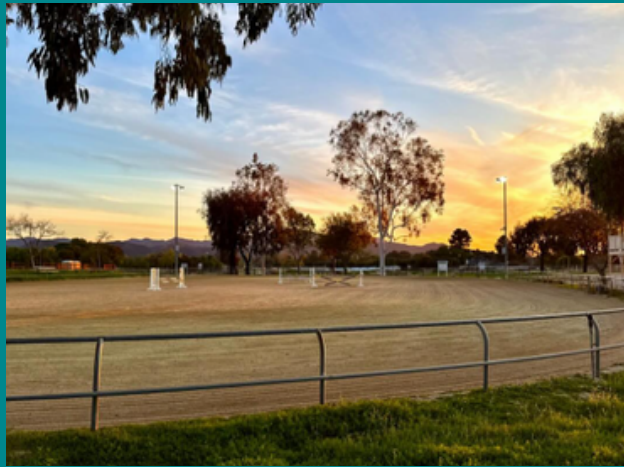
Main Arena: 233' × 137'