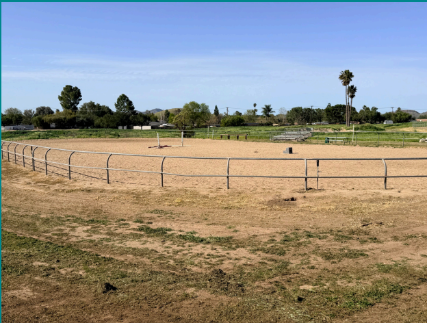
Warm-Up Arena: 187' × 92'