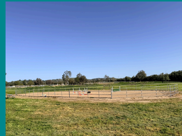
Princeton Arena: 130' × 90'